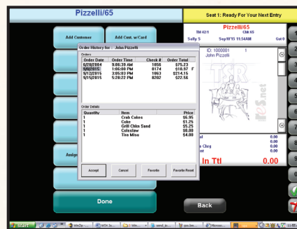
Screen shows customer's order history, making it easier to add menu items.