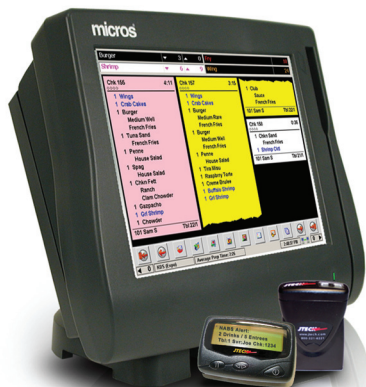
MICROS KDS with integrated JTECH pagers provides end-to-end kitchen communications.