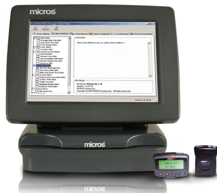
Alert Manager, with the use of JTECH pagers, can alert employees on eventualities within the restaurant.